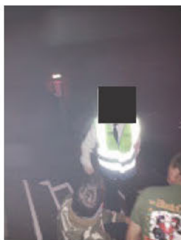
wembley arena staff photo.jpg 3470K